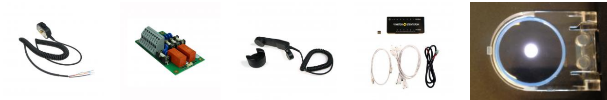
EMMAI-2H Item number: 1023533312